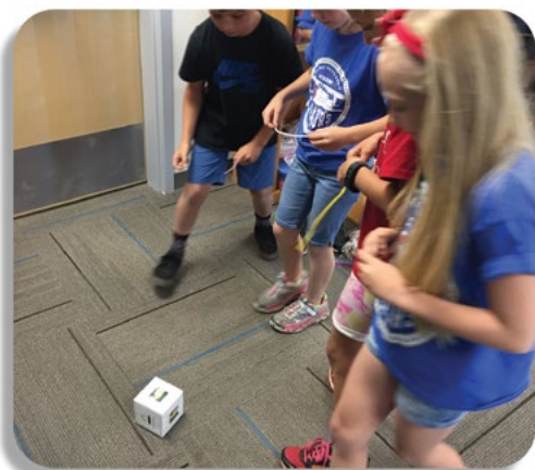
Students rolled dice at the water cycle stations to determine their next step through the water cycle.

The Arizona Farm Bureau Ag in the Classroom Program (AZFB AITC) celebrated Earth Day with a lesson on water. Nearly 10,000 kindergarten through 3 rd grade students across the state learned about how farmers and ranchers celebrated Earth Day everyday by caring for our land, using technology to conserve water, and help to recycle our air by planting trees and crops. Students also learned that our planet even recycles water through the water cycle. After reading a story about water, students kindergarten through 1 st grade sang the water cycle song and made a water cycle bracelet, and students 2 nd through 3 rd grade became a water droplet and traveled their own unique journeys through the water cycle.